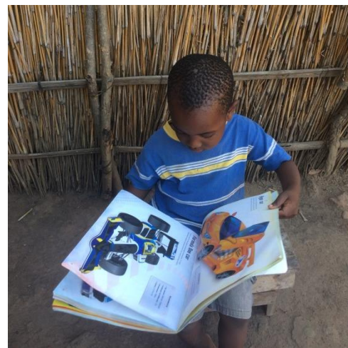
Child at Mzewe Day Care cars in a book