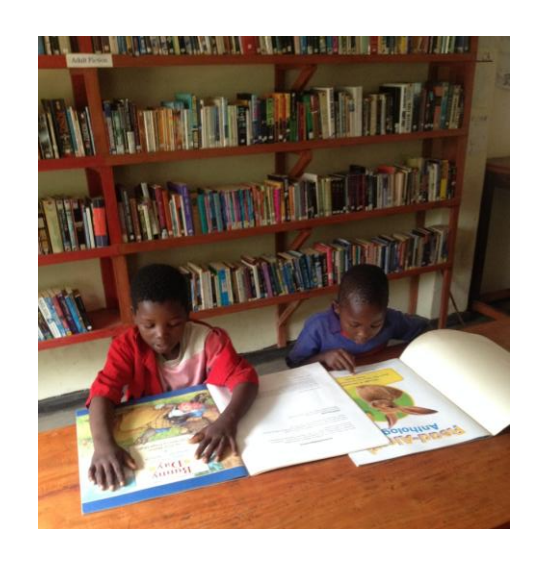
Future for All Day Care Centre