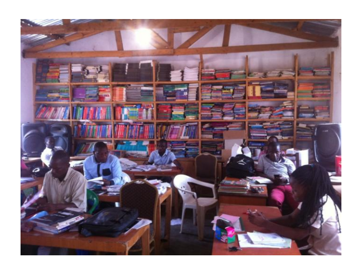
Madzanje Senior Secondary School